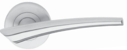
Vinci #702 SPECIAL ORDERS ONLY

The Schlage 7000 series is tested to 150,000 cycles to guarantee reliability and peace of mind.