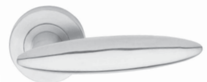
Siluro #709 STOCKED