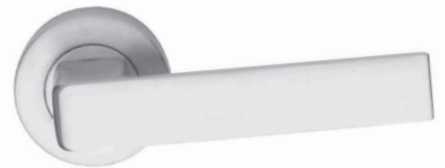
Angelo #714 STOCKED