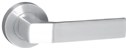
Katz #710 SPECIAL ORDERS ONLY