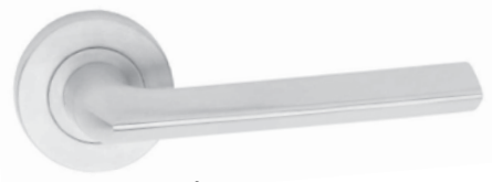
Dulag #708 STOCKED