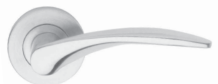
Fattori #704 STOCKED