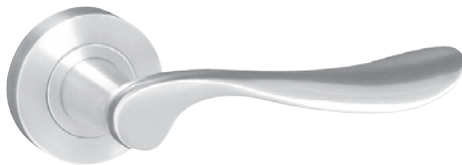
Kahlo #707 SPECIAL ORDERS ONLY