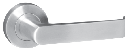
Dali #712 STOCKED