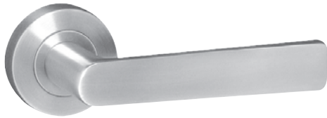
Gavarni #711 SPECIAL ORDERS ONLY