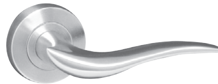
Degas #705 SPECIAL ORDERS ONLY