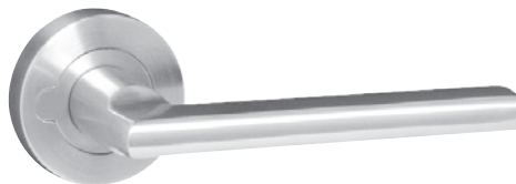
Albo #713 STOCKED