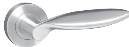
Vargas #701 STOCKED

Contact Customer Services on 1800 098 094