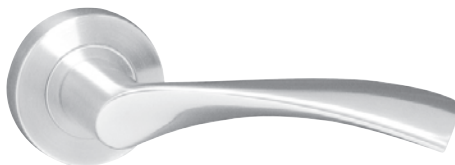
Raphael #706 STOCKED